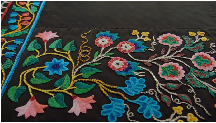
The Flower Beadwork People Parks Canada (click on the Image)

MYBC YOUTH: The Forgotten Ones-Voices of the Métis in BC.